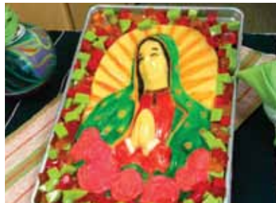
Left: members of the Latina mother's group using Rosetta Stone on the computer, smartphone and tablet. Right: a Jell-O masterpiece