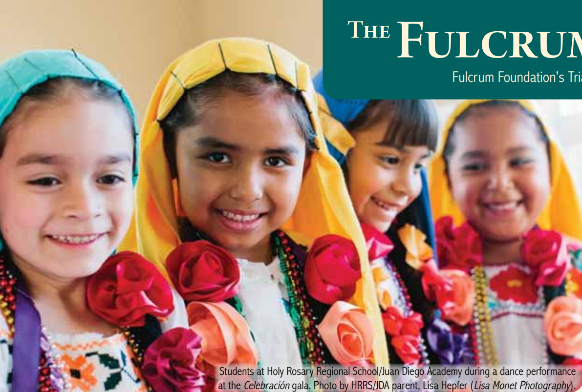
Students at Holy Rosary Regional School/Juan Diego Academy during a dance performance at the Celebración gala.